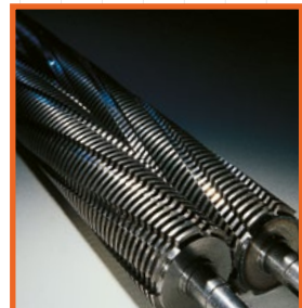
CARBON HARDENED STEEL CUTTING KNIVES unaffected by staples and clips